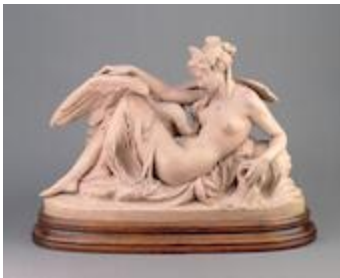
CARRIER-BELLEUSE, Albert-Ernest Leda and the Swan c. 1858 terracotta 92.85.5 9812 Minneapolis, Minnesota, The Minneapolis Institute of Art