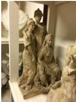
ELSINGER, Gustave The Great Sacrifice

terracotta formerly/autrefois 1950.42 3918 formerly/autrefois San Francisco, California, Fine Arts Museums of San Francisco, Legion of Honor