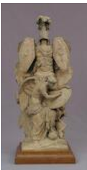
MOITTE, Jean-Guillaume Victory Writing on a Shield 1789 terracotta 2012.453 7313 New York, New York, The Metropolitan Museum of Art