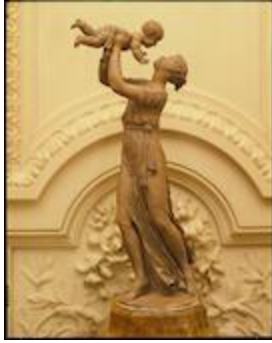
CLODION, Claude MICHEL, called Young Woman Holding Her Child in front of Her c. 1785-1790 terracotta on a painted wood socle 16.5 2681 San Marino, California, The Huntington Library, Art Museum, and Botanical Gardens