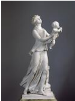
CLODION, Claude MICHEL, called A Young Woman Presenting Her Child at an Altar c. 1780-1790 terracotta 16.6 3005 San Marino, California, The Huntington Library, Art Museum, and Botanical Gardens