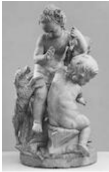
France 19th century Three Children and a dog probably 19th c. terracotta formerly/autrefois 65.41 2583 formerly/autrefois New York, New York, The Metropolitan Museum of Art