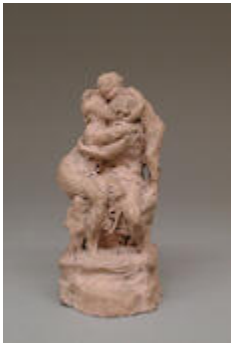
CARPEAUX, Jean-Baptiste Le Trait d'union 1872 terracotta 2012.214 7306 New York, New York, The Metropolitan Museum of Art