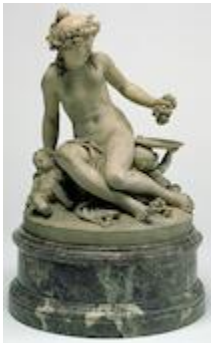
CLODION, Claude MICHEL, called Nymph With Two Children terracotta on marble base SC 1973:7-1 and TR 2338 3831 Northampton, Massachusetts, Smith College Museum of Art