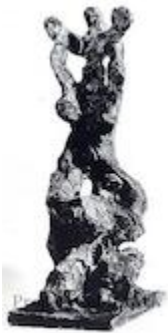
LIPCHITZ, Ossip/Jacques Rescue of the Child 1933 terracotta 1979.023.027 7676 Tucson, Arizona, University of Arizona Museum of Art