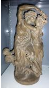
CLODION, Claude MICHEL, called Satyr putting a crown over a nymph's head, with a young satyr terracotta 1991.29 12681 Boston, Massachusetts, McMullen Museum of Art, Boston College