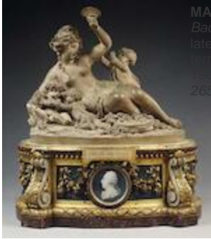
MARIN, Joseph-Charles Bacchante with Chalice and Three Infants late 18th century terracotta, on a painted and gilt wood pedestal 1983.185.5 2654 New York, New York, The Metropolitan Museum of Art