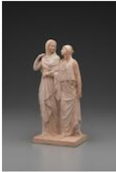
France 19th century Two Women in Antique Dress

terracotta 2009.045.151 7794 Notre Dame, Indiana, University of Notre Dame, Raclin Murphy Museum of Art (formerly Snite Museum of Art)