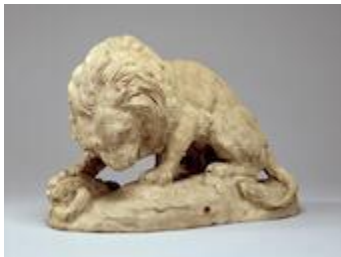
BARYE, Antoine-Louis Lion and Snake ca. 1832 terracotta 27.548 6152 Baltimore, Maryland, The Walters Art Museum