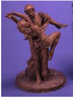
CHARPENTIER-MIO, Maurice Spessivitzeva and Lifar in Giselle

terracotta T&D 1962.148 766 San Francisco, California, Fine Arts Museums of San Francisco, Legion of Honor