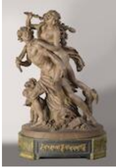
CLODION, Claude MICHEL, called A Follower of Bacchus Carrying a Bacchante on His Back 1790's terracotta 1939-41-31Ba, b 3811 Philadelphia, Pennsylvania, Philadelphia Museum of Art