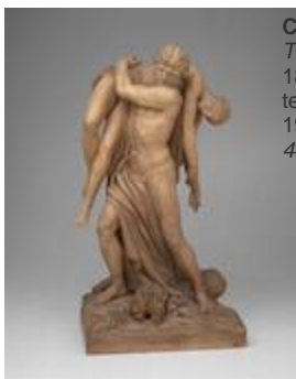
CLODION, Claude MICHEL, called The Flood 1800 terracotta 1981.398 4880 Boston, Massachusetts, Museum of Fine Arts