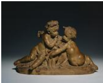
CARRIER-BELLEUSE, Albert-Ernest Putti Representing Earth and Water 1865 terracotta; made of cast terracotta with finishing details added by hand after casting; thin wash of greenish brown pigment applied over entire surface 1986.67 3484 Cleveland, Ohio, The Cleveland Museum of Art