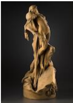
HÉBERT, Emile Forever!! Never!!

1859 terracotta 74.034 4029 Providence, Rhode Island, Rhode Island School of Design Museum of Art