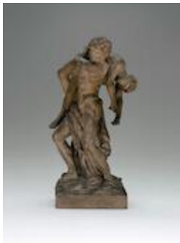
CLODION, Claude MICHEL, called Study for The Deluge c. 1800

terracotta 1977.59.1 4514 Washington, D.C., District of Columbia, The National Gallery of Art