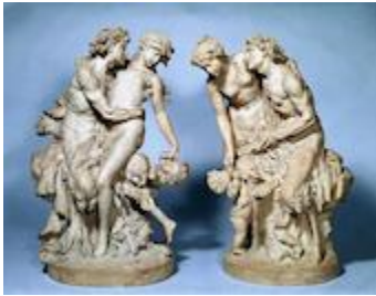
CLODION, Claude MICHEL, called Bacchic Group with Nymph, Satyr and Infant (one of a pair) c. 1775 terracotta M1977.12b 10073 Milwaukee, Wisconsin, Milwaukee Art Museum