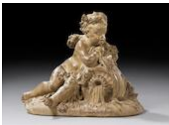
CARRIER-BELLEUSE, Albert-Ernest Source Child 1864 terracotta 2015.3 10449 Portland, Maine, Portland Museum of Art