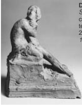
DAVID D'ANGERS, Pierre-Jean Study for a Female Figure with two Children c. 1821-1833 terracotta 2001.773.3 1674 New York, New York, The Metropolitan Museum of Art