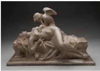
CARRIER-BELLEUSE, Albert-Ernest Cupid and Psyche burnished terracotta 1992.002 2095 Notre Dame, Indiana, University of Notre Dame, Raclin Murphy Museum of Art (formerly Snite Museum of Art)