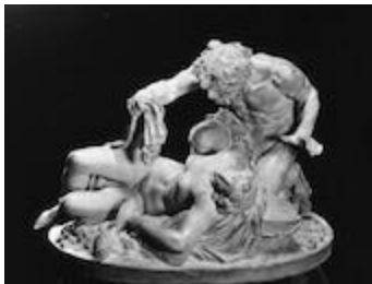
CLODION, Claude MICHEL, called Satyr and Nymph, Satyr Unveiling a Naked bacchante terracotta 27.354 3817 Baltimore, Maryland, The Walters Art Museum