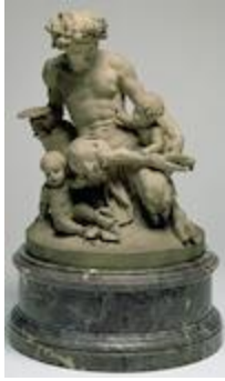
CLODION, Claude MICHEL, called Satyr With Two Children

terracotta on marble base SC 1973.7-2 and TR 2338 3825 Northampton, Massachusetts, Smith College Museum of Art