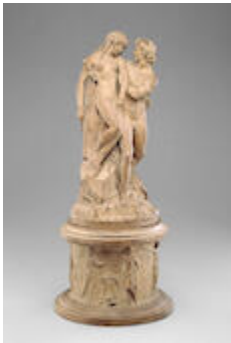
CHINARD, Joseph Perseus Rescuing Andromeda

terracotta T&D 1962.148 766 San Francisco, California, Fine Arts Museums of San Francisco, Legion of Honor