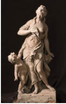
LEMOYNE, Jean-Louis The Fear of Cupid's Arrows second half of the 18th century terracotta F.1965.1.112.S 2763 Pasadena, California, Norton Simon Museum