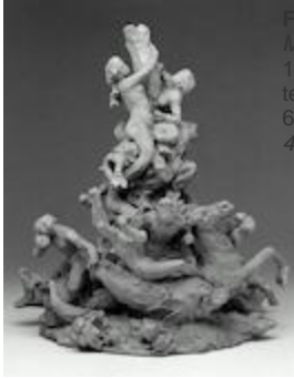
FREMIET, Emmanuel Model for a fountain 1874 terracotta 69.1225 4914 Boston, Massachusetts, Museum of Fine Arts