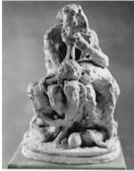
CARPEAUX, Jean-Baptiste Ugolino and his children 1857-1861 lightly burned clay 62.980 4859 Boston, Massachusetts, Museum of Fine Arts