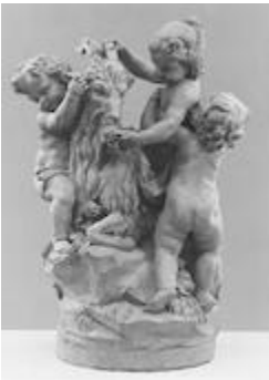
France 19th century Three Children and a Goat probably 19th c. terracotta formerly/autrefois 64.289 2578 formerly/autrefois New York, New York, The Metropolitan Museum of Art