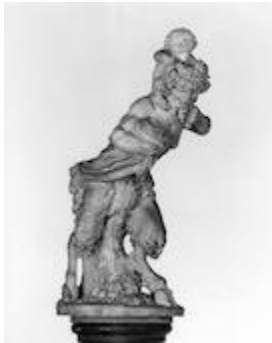
CLODION, Claude MICHEL, called Satyr Carrying a Young Faun

12682 Boston, Massachusetts, McMullen Museum of Art, Boston College