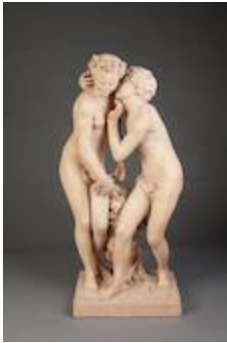
CARPEAUX, Jean-Baptiste Daphnis and Chloe 1875 terracotta 1966.1 4282 Memphis, Tennessee, Dixon Gallery and Gardens