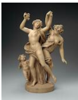
CLODION, Claude MICHEL, called Two Dancing Bacchantes and a Putto 1800 terracotta 65.2212 4881 Boston, Massachusetts, Museum of Fine Arts