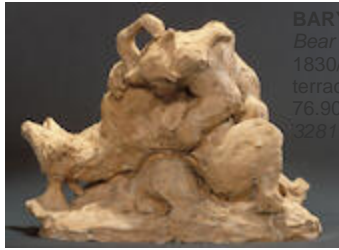
BARYE, Antoine-Louis Bear Overpowering a Deer 1830-1838 terracotta 76.96 3283 Detroit, Michigan, Detroit Institute of Arts