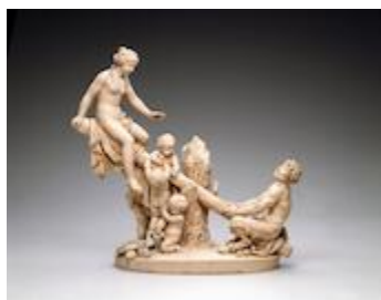
CLODION, Claude MICHEL, called The See-Saw c. 1775 terracotta 1957.16 3821 Toledo, Ohio, Toledo Museum of Art