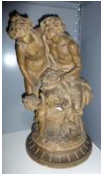
CLODION, Claude MICHEL, called Satyr, Bacchante and Young Child

1834 Springfield, Massachusetts, Michele & Donald D'Amour Museum of Fine Arts