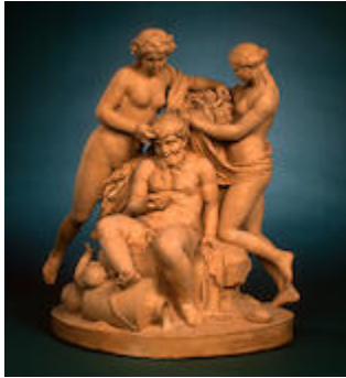
CLODION, Claude MICHEL, called Silenus Crowned by Nymphs 1768

terracotta on marble base SC 1973.7-2 and TR 2338 3825 Northampton, Massachusetts, Smith College Museum of Art