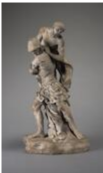
France 18th century Aeneas Carrying Anchises c. 1753 terracotta y1938-1 1990 Princeton, New Jersey, Princeton University Art Museum