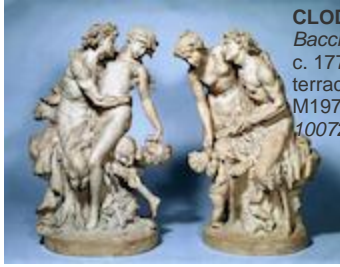
CLODION, Claude MICHEL, called Bacchic Group with Nymph, Satyr and Infant (one of a pair) c. 1775 terracotta M1977.12a 10072 Milwaukee, Wisconsin, Milwaukee Art Museum