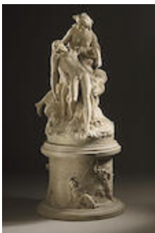
CHINARD, Joseph Venus and Aeneas or Achilles

c. 1801-1805 terracotta 85.SC.82 491 Los Angeles, California, The J. Paul Getty Museum