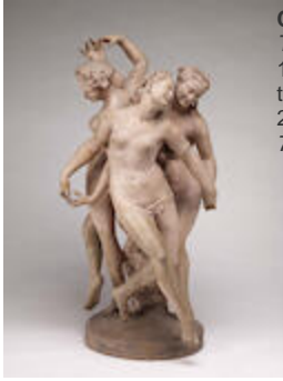
CARPEAUX, Jean-Baptiste The Three Graces 1875 terracotta with Arabescato marble base 2001.111.2a-b 755 San Francisco, California, Fine Arts Museums of San Francisco, Legion of Honor