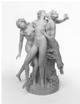
CLODION, Claude MICHEL, called Satyr with Two Bacchantes late 19th century terracotta 73.SC.40 468 Los Angeles, California, The J. Paul Getty Museum