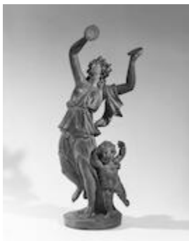
CLODION, Claude MICHEL, called Dancing Bacchante with Amour 1785 terracotta 4944.1 7822 Honolulu, Hawaii, Honolulu Museum of Art

terracotta 60.61 3833 Seattle, Washington, Seattle Art Museum