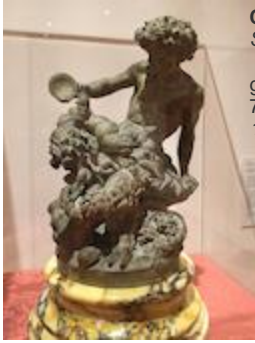
CLODION, Claude MICHEL, called Satyr and Two Infant Satyrs