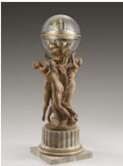
CLODION, Claude MICHEL, called The Dance of Time, Three Nymphs Supporting a Clock 1788

terracotta 1989.310 4882 Boston, Massachusetts, Museum of Fine Arts