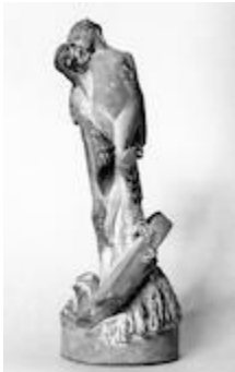
HÉBERT, Emile And Always! And Never!

c. 1916 terracotta 1983.1.72 4593 Washington, D.C., District of Columbia, The National Gallery of Art