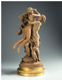
CLODION, Claude MICHEL, called Bacchant and Bacchante with a Cupid 1799 terracotta 1975.74 3813 Cincinnati, Ohio, Cincinnati Art Museum