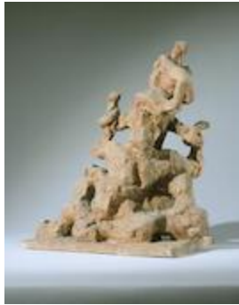
LIPCHITZ, Ossip/Jacques Rescue of the Child: Maquette No. 3 1933 terracotta 2002-88-3 8270 Philadelphia, Pennsylvania, Philadelphia Museum of Art