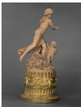
CLODION, Claude MICHEL, called The Surprise 1799 terracotta 1942.12.1 4510 Washington, D.C., District of Columbia, The National Gallery of Art