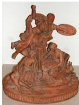
BOIZOT, Louis-Simon Allegorical Group after 1773 terracotta 1988.077 10432 Nashville, Tennessee, Vanderbilt University Fine Arts Gallery