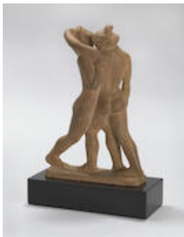
MAILLOL, Aristide Two Women 1900 terracotta on black marble base SPC43.90 1794 New York, New York, The Museum of Modern Art

terracotta 53.945a-b 4955 Boston, Massachusetts, Museum of Fine Arts