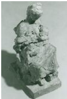
DALOU, Aimé-Jules Mother and Child c. 1890 terracotta 3871 Albuquerque, New Mexico, University of New Mexico Art Museum