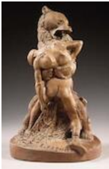
FREMIET, Emmanuel The Wounded Bear original model ca. 1850 cast terracotta 1990.108 1678 New York, New York, The Metropolitan Museum of Art