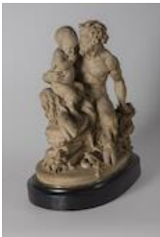
SALY, Jacques Faun Holding an Infant Faun 1774 unglazed terracotta 1999.13.1A,B 4251 Hartford, Connecticut, Wadsworth Atheneum