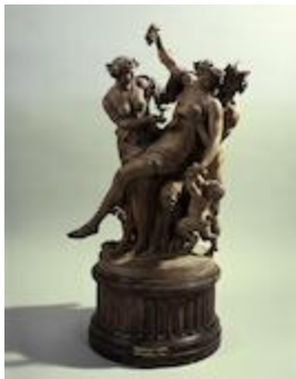
CLODION, Claude MICHEL, called Satyr with two Bacchantes 1799 terracotta 1916.2.75 1224 New York, New York, The Frick Collection