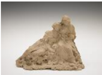
BARTLETT, Paul Wayland

2592 New York, New York, The Metropolitan Museum of Art