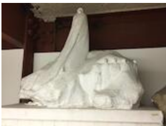
ELSINGER, Gustave The Hostages

terracotta 1926.08.001 10828 Goldendale, Washington, Maryhill Museum of Art