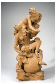
France 18th century Allegory of Minerva Freeing Chained Mankind c. 1730-40 terracotta 1958.20 5622 Wellesley, Massachusetts, Davis Museum and Cultural Center