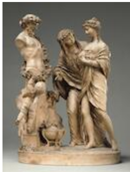
CLODION, Claude MICHEL, called Offering to Priapus c. 1775 terracotta 85.SC.166 467 Los Angeles, California, The J. Paul Getty Museum