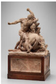
STOUF, Jean-Baptiste Hercules Fighting Two Centaurs c. 1785 terracotta 71.396.A 3423 Detroit, Michigan, Detroit Institute of Arts