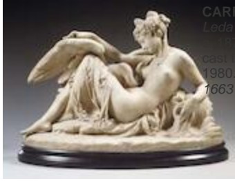
CARRIER-BELLEUSE, Albert-Ernest Leda and the Swan 1870 cast terracotta 1980.123 1663 New York, New York, The Metropolitan Museum of Art