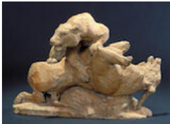
BARYE, Antoine-Louis Jaguar Overcoming an Antelope terracotta 76.91 3283 Detroit, Michigan, Detroit Institute of Arts