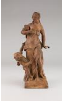
LEMOYNE, Jean-Louis The Fear of Love 1742 terracotta 1959.551 7987 Chicago, Illinois, The Art Institute of Chicago