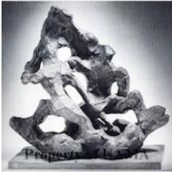
LIPCHITZ, Ossip/Jacques Towards a New World 1934 terracotta 1979.023.029 7699 Tucson, Arizona, University of Arizona Museum of Art