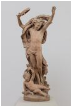
CARPEAUX, Jean-Baptiste The Spirit of the Dance c. 1875 terracotta 1988.5 8002 Santa Barbara, California, Santa Barbara Museum of Art