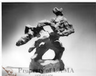
LIPCHITZ, Ossip/Jacques Prometheus Strangling the Vulture 1933 terracotta 1979.023.026 7675 Tucson, Arizona, University of Arizona Museum of Art