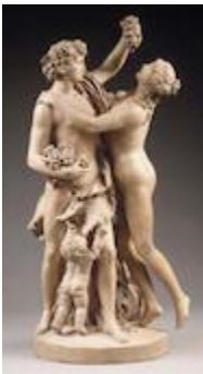
CLODION, Claude MICHEL, called Bacchus and a Nymph, with a Child and Grapes 1790-1800 terracotta 14.40.679 2604 New York, New York, The Metropolitan Museum of Art