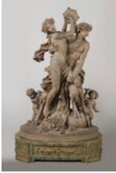
CLODION, Claude MICHEL, called Satyr Lifting a Tambourine-Playing Bacchante, or, Satyr Carrying a Nymph Accompanied by a Baby Satyr and Two Putti 1798 terracotta 1939-41-31Aa, b 3805 Philadelphia, Pennsylvania, Philadelphia Museum of Art