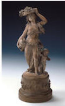
CLODION, Claude MICHEL, called Nymph early 19th century terracotta 1999.935 11214 Newport, Rhode Island, Rough Point