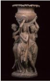
CARRIER-BELLEUSE, Albert-Ernest The Three Graces

terracotta 1998.29 8005 Santa Barbara, California, Santa Barbara Museum of Art