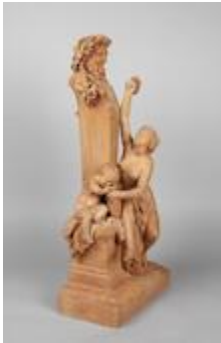
CARRIER-BELLEUSE, Albert-Ernest Offering to Bacchus 1868 terracotta 1991-46 7879 Princeton, New Jersey, Princeton University Art Museum