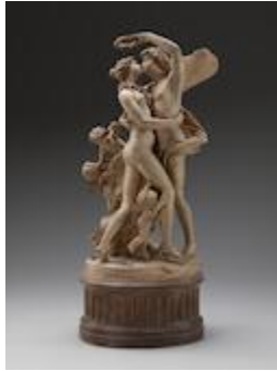
CLODION, Claude MICHEL, called Zephyrus and Flora 1799 terracotta 1915.2.76 379 New York, New York, The Frick Collection