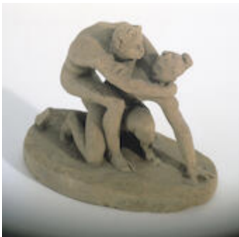
GÉRICAUT, Théodore Nymph and Satyr c. 1817-1820 terracotta 1952:8.1 4006 Buffalo, New York, Albright-Knox Art Gallery