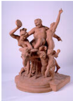
CARRIER-BELLEUSE, Albert-Ernest Triumph of Silenus

terracotta 1998.29 8005 Santa Barbara, California, Santa Barbara Museum of Art