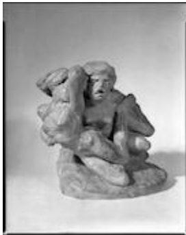
France 20th century Two Female Figures

terracotta 2009.045.151 7794 Notre Dame, Indiana, University of Notre Dame, Raclin Murphy Museum of Art (formerly Snite Museum of Art)