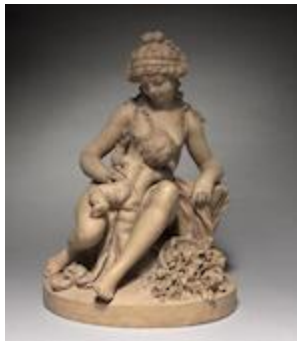
CLODION, Claude MICHEL, called Satyress Playing with a Baby Satyr

5942 Baltimore, Maryland, The Walters Art Museum