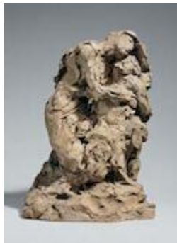
CARPEAUX, Jean-Baptiste Pietà c. 1864 terracotta 2001.199 1662 New York, New York, The Metropolitan Museum of Art