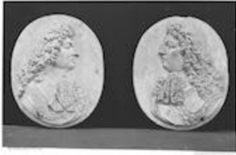
France 17th century Louis of France, The Grand Dauphin (1661-1711) late 17th century white marble 07.225.198 b 2548 New York, New York, The Metropolitan Museum of Art