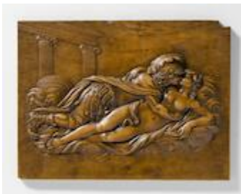
France 17th century Relief of Mars and Venus 17th century boxwood or a fruitwood 1930-64-26 8061 Philadelphia, Pennsylvania, Philadelphia Museum of Art