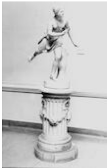
France 17th century Atalanta 18th c. terracotta formerly/autrefois 1941.61 7068 formerly/autrefois Louisville, Kentucky, The Speed Art Museum