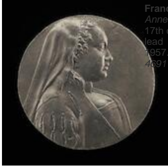
France 17th century Anne of Austria (1601-1666), Wife of King Louis XIII of France 1615 17th century lead 1957.14.1299 4697 Washington, D.C., District of Columbia, The National Gallery of Art