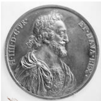
France 17th century Henry IV, King of France c. 1600-1610 bronze 36.110.27 a 7162 New York, New York, The Metropolitan Museum of Art