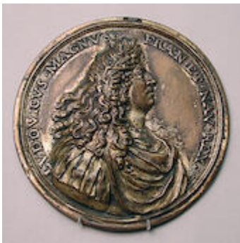
France 17th century Louis XIV c. 1675 bronze with remnants of gilding 1991.346 7164 New York, New York, The Metropolitan Museum of Art