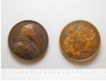
France 17th century Louis XIV 1667 bronze 2001.87.30485 11529 New Haven, Connecticut, Yale University Art Gallery