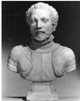
France 17th century Bust of a Man c. 1600-1625 white marble 1962.20 5560 Toledo, Ohio, Toledo Museum of Art