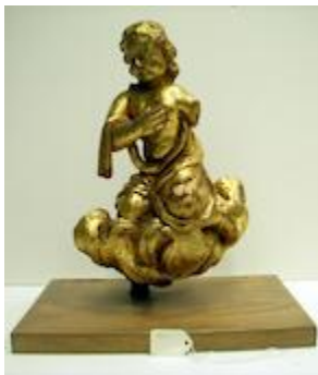
France 17th century Angel 17th century gilded wood 50.1.1 10040 Madison, Wisconsin, Chazen Museum of Art