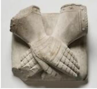
France 17th century Pair of Gauntlets c. 1600-1620 stone 1945-25-103 8050 Philadelphia, Pennsylvania, Philadelphia Museum of Art