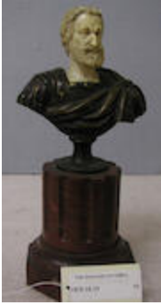
France 17th century Henry IV

bronze and ivory 1979.14.10 11242 New Haven, Connecticut, Yale University Art Gallery