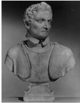
France 17th century Bust of a Man c. 1600-1625 white marble 1962.19 5559 Toledo, Ohio, Toledo Museum of Art