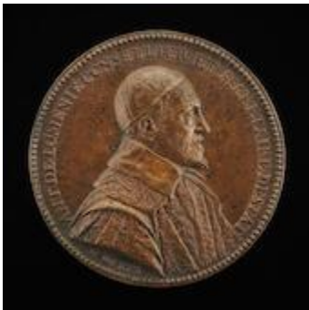
France 17th century Antoine de Loménie (1560-1638), Councilor and Secretary of State (obverse), Sun Driving Along the Zodiac (reverse) 1630 bronze 1957.14.1175.a, b 4689 Washington, D.C., District of Columbia, The National Gallery of Art