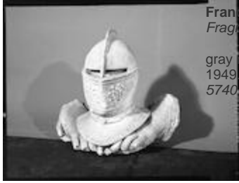
France 17th century Fragment of a Figure, Wearing Casque and Gloves gray marble 1949.47.24 5740 Cambridge, Massachusetts, Harvard Art Museums