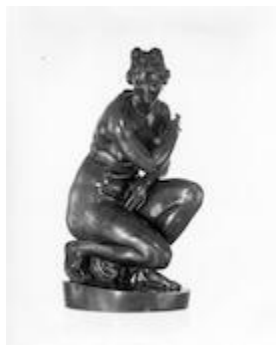
France 17th century Crouching Venus c. 1700 bronze 1992.34 5571 Toledo, Ohio, Toledo Museum of Art

07.251.45 7158 New York, New York, The Metropolitan Museum of Art