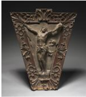
France 17th century Crucifixion c. 1680 terracotta 1966.363 3446 Cleveland, Ohio, The Cleveland Museum of Art