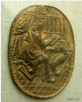
France 17th century Saint John the Evangelist c. 1600 gilt bronze 1957.13.1 12296 New Haven, Connecticut, Yale University Art Gallery