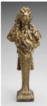
France 17th century Louis XIV or Marechal Turenne Presentation Bust bronze SC 1972:33-6 11154 Northampton, Massachusetts, Smith College Museum of Art