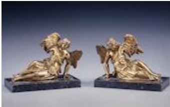
France 17th century Gilded Angel, one of a pair maybe 17th century gilt bronze on marble base 61.27A 7412 Bloomington, Indiana, Eskenazi Museum of Art, Indiana University (formally Indiana University Art Museum)