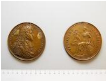
France 17th century Louis XIV 1672 bronze 2001.87.27595 11632 New Haven, Connecticut, Yale University Art Gallery