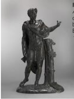
France 17th century A Roman Emperor cast 1830s, imitator of French 17th century bronzes bronze B1977.14.8 13201 New Haven, Connecticut, Yale Center for British Art