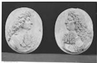
France 17th century Louis XIV (1638-1715) late 17th century white marble 07.225.198a 2547 New York, New York, The Metropolitan Museum of Art