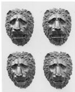
France 17th century Mask of a Lion, probably from a fountain 17th century bronze 07.225.420d 2228 New York, New York, The Metropolitan Museum of Art