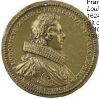
France 17th century Louis XIII, King of France (b. 1601, r. 1610-43) 1624 gilt copper alloy cast 2016.2.17 13495 New York, New York, The Frick Collection