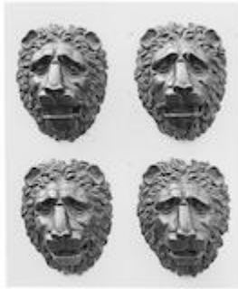
France 17th century Mask of a Lion, probably from a fountain 17th century bronze 07.225.420c 2227 New York, New York, The Metropolitan Museum of Art