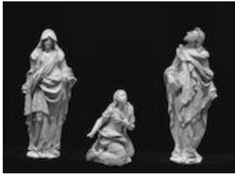
France 17th century The Virgin, figure from a Crucifixion early 17th century ivory or bone 55.468 5030 Boston, Massachusetts, Museum of Fine Arts