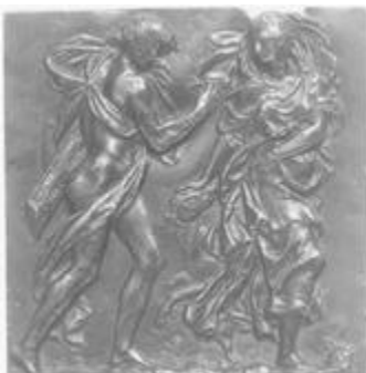
France 17th century Apollo and Diana 17th century bronze 31.33.13 3182 New York, New York, The Metropolitan Museum of Art