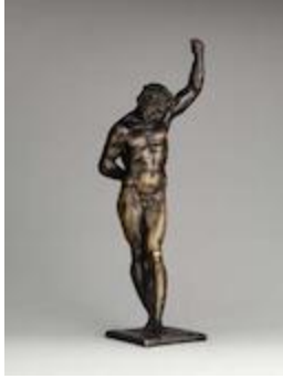
France 17th century Pluto mid-17th c. bronze 25.142.10 1780 New York, New York, The Metropolitan Museum of Art