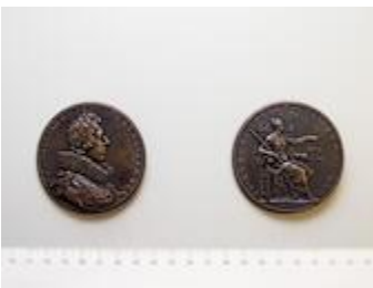
France 17th century Louis XIII, King of France (1610-1643) 1623 bronze 1960.29.4 12333 New Haven, Connecticut, Yale University Art Gallery