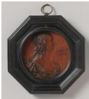
France 17th century Portrait of a Lady 17th century red wax 1943-95-5 8100 Philadelphia, Pennsylvania, Philadelphia Museum of Art