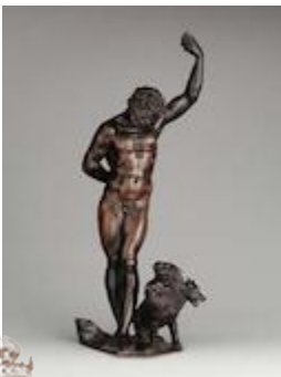
France 17th century Pluto and Cerberus mid-17th century, probably after a late 16th century model bronze 1978.516.6 2216 New York, New York, The Metropolitan Museum of Art