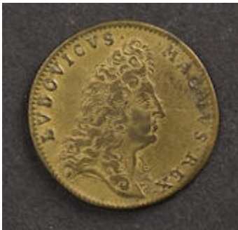
France 17th century Louis XIV (1638-1715), King of France designed 17th century, early strike brass 1974.183 10036 Madison, Wisconsin, Chazen Museum of Art