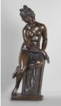
France 17th century Allegorical Figure of Architecture c. 1675-1725 bronze 1930-1-23 8051 Philadelphia, Pennsylvania, Philadelphia Museum of Art