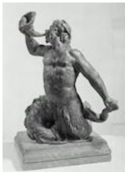
France 17th century Triton late 17th century lead 60.236b 5025 Boston, Massachusetts, Museum of Fine Arts