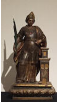
France 17th century Saint Barbara 1600-1699 polychromed wood 1983.021 10430 Nashville, Tennessee, Vanderbilt University Fine Arts Gallery