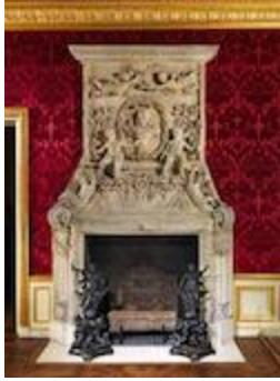
France 17th century Chimneypiece c. 1660-1670 limestone 56.234.34 1782 New York, New York, The Metropolitan Museum of Art