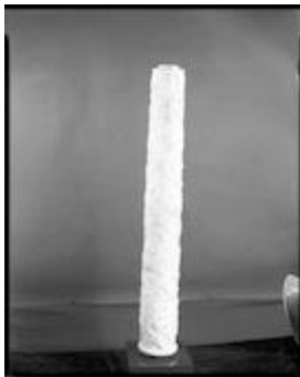
France 17th century Column with Floral and Foliate Decoration 1600-1625 marble 1961.148 5798 Cambridge, Massachusetts, Harvard Art Museums