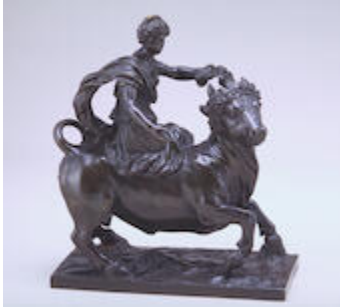
France 17th century Europa and the Bull bronze 39.5.5 723 San Francisco, California, Fine Arts Museums of San Francisco, Legion of Honor