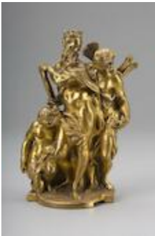
France 17th century Allegorical Group gilded bronze 63.6 5027 Boston, Massachusetts, Museum of Fine Arts