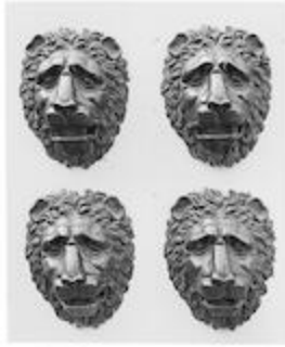
France 17th century Mask of a Lion, probably from a fountain 17th century bronze 07.225.420b 2226 New York, New York, The Metropolitan Museum of Art