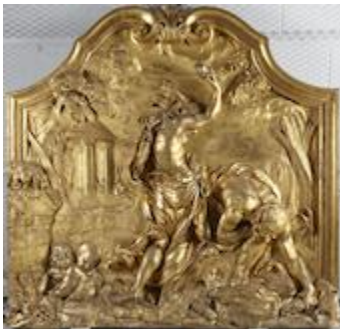
France 17th century Deucalion and Pyrrha late 17th-early 18th century gilt wood y1991-64 7892 Princeton, New Jersey, Princeton University Art Museum