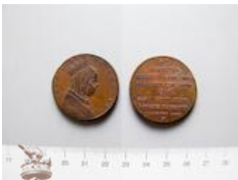
France 17th century King Jean I le Posthume 1643-1715 bronze 2001.87.26617 12232 New Haven, Connecticut, Yale University Art Gallery