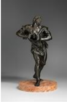
France 17th century Hercules with the Coat of Nessus 17th century bronze on marble base 49.7.61 12670 New York, New York, The Metropolitan Museum of Art