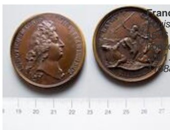
France 17th century Louis XIV / Batavis Caesis

bronze 1966.131.87.27099 1988 New Haven, Connecticut, Yale University Art Gallery