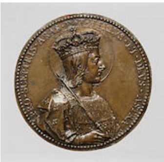
France 17th century Louis XIII / Facade of the church of Saint-Paul-Saint-Louis 17th century bronze 1989.73 7165 New York, New York, The Metropolitan Museum of Art