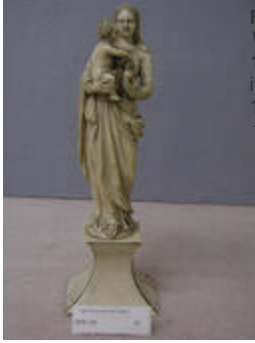
France 17th century Virgin and Child holding a burning heart 1590-1620 ivory on top of wooden base with bone (?) 1975.116 1237 New Haven, Connecticut, Yale University Art Gallery