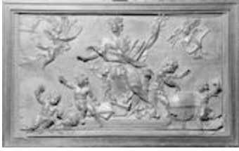
France 17th century Panel Emblematical of the Arts 1600-1700 wood 1962.819 6404 Chicago, Illinois, The Art Institute of Chicago