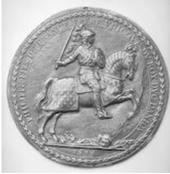
France 17th century Philip of France, Duke of Anjou (1640-1701) 1655 bronze 25.203.9 7161 New York, New York, The Metropolitan Museum of Art