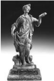
France 17th century Flora 17th century terracotta on modern painted and gilt wood base AC1998.124.1-2 2984 Los Angeles, California, Los Angeles County Museum of Art