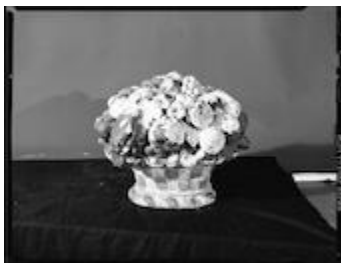
France 17th century Basket of Fruit plaster with pigment 1949.47.26 5741 Cambridge, Massachusetts, Harvard Art Museums