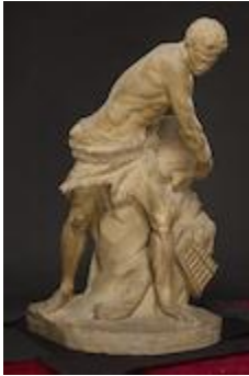
France 17th century Polyphemus c. 1700 terracotta 64.80 9911 Minneapolis, Minnesota, The Minneapolis Institute of Art