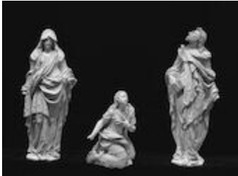
France 17th century Saint John, figure from a Crucifixion early 17th century ivory or bone 55.469 5029 Boston, Massachusetts, Museum of Fine Arts