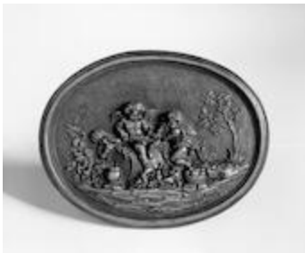
France 17th century Plaque wood 80:1924 9580 Saint Louis, Missouri, Saint Louis Art Museum