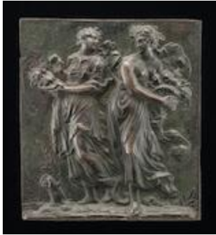
France 16th century;France 17th century Winter and Autumn c. 1600 bronze with dark brown patina 1957.14.543 4756 Washington, D.C., District of Columbia, The National Gallery of Art