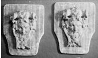
France 17th century Pair of Masks c. 1700 wood, traces of gesso 1938.91 a-b 6391 Chicago, Illinois, The Art Institute of Chicago