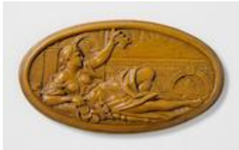
France 17th century Plaque of Phèdre throwing away her royal ornaments late 17th-early 18th century boxwood 1930-64-27 8062 Philadelphia, Pennsylvania, Philadelphia Museum of Art