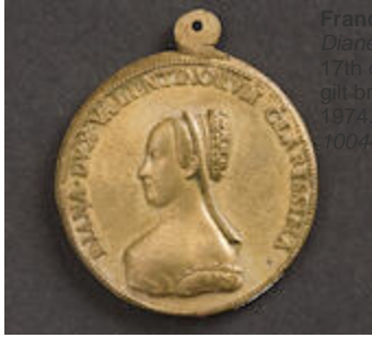
France 17th century Diane de Poitiers 17th century restituton, 17th-18th century cast gilt-bronze 1974.133 10044 Madison, Wisconsin, Chazen Museum of Art