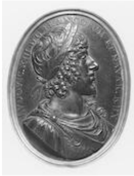
France 17th century Louis XIII, King of France 17th century bronze in brass frame 60.55.44 7163 New York, New York, The Metropolitan Museum of Art