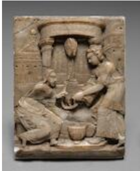
France 17th century Christ and the Woman of Samaria alabaster 1942.860 3559 Cleveland, Ohio, The Cleveland Museum of Art