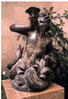
France 17th century Triton Blowing on a Conch Shell c. 1700 lead 1973.36 5562 Toledo, Ohio, Toledo Museum of Art