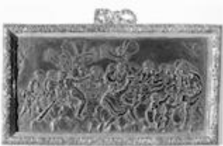
France 17th century Mythological Banquet Scene c. 1680 bronze 1970.1046 6442 Chicago, Illinois, The Art Institute of Chicago