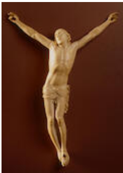
France 17th century Christ mid-17th century ivory M1991.59 10095 Milwaukee, Wisconsin, Milwaukee Art Museum