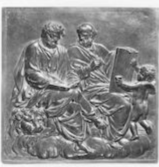
France 17th century Saints Mark and Matthew 17th century bronze 1985.195.5 2232 New York, New York, The Metropolitan Museum of Art