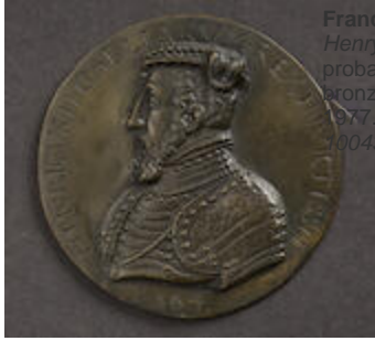
France 17th century Henry II, King of France probably a 17th century restitution bronze 1977.1467 10043 Madison, Wisconsin, Chazen Museum of Art